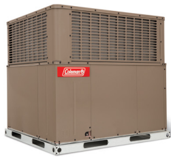
PCE6 (ELECTRIC HEAT) PCG6 (GAS HEAT)