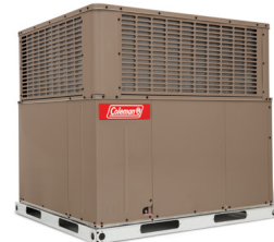
PHE6 (ELECTRIC HEAT) PHG6 (GAS HEAT)