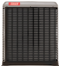
THF2 HC19 HC20